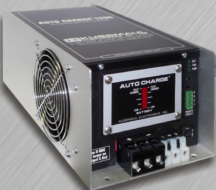
MODEL # 091-187-12

The Auto Charge 1200 is a fully automatic battery charger with a very high output for vehicles with a single battery system. Remote voltage sensing is provided to compensate the charger output for the voltage drop in the charging wires. No sense lead wires are required. It is ruggedly constructed for mounting in the vehicle. May be used for positive and negative ground systems.