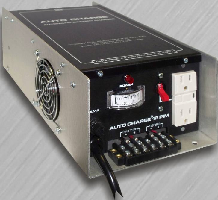
MODEL # 091-12PIM

The Auto Charge 12 PIM is a fully automatic battery charger with a separate Ground Fault Interrupter and 15 amp circuit breaker for vehicles with a single battery. Remote voltage sensing is provided to compensate the charger output for the voltage drop in the charging wires. It is ruggedly constructed for mounting in the vehicle.