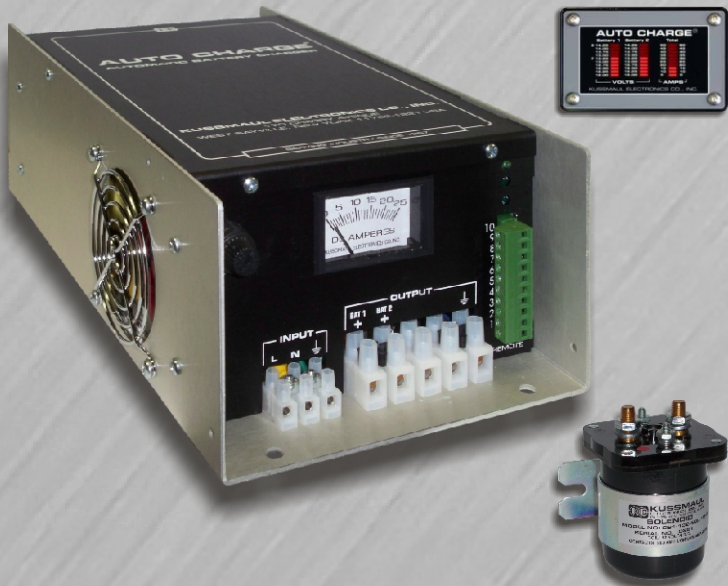
MODEL # 091-171-12

The Add-A-Bat provides a battery charger for the vehicle's battery as well as the newly installed auxiliary battery. The accessories are connected to the auxiliary battery and thus reduces the burden on the vehicle's battery. A high current solenoid connects the two batteries whenever the alternator output is detected. This charges both batteries when the engine is running. An Auto Boost feature parallels the batteries for engine cranking whenever the auxiliary battery has sufficient charge.