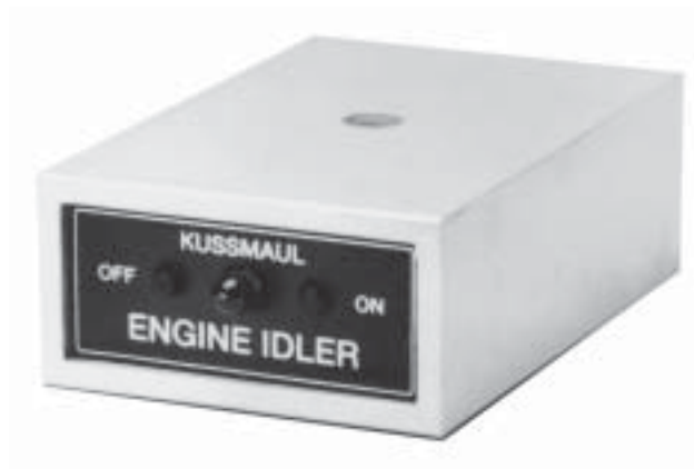
ENGINE IDLER MODEL #091-84-005