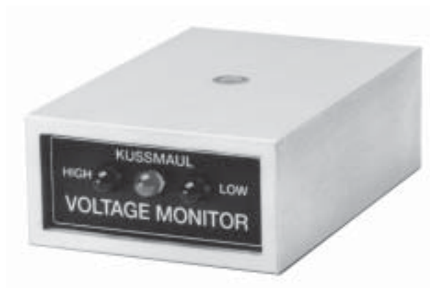
VOLTAGE MONITOR MODEL #091-84-004