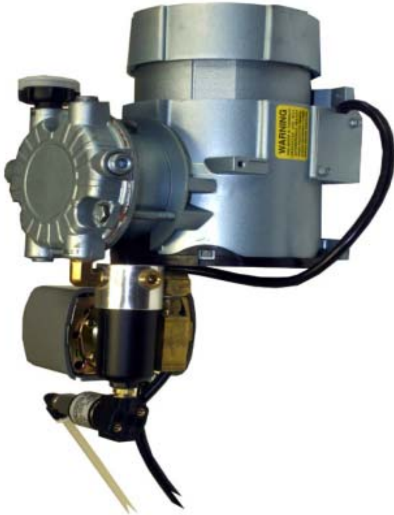
091-9-089 AUTO DRAIN INSTALLED ON 091-9B-1 AUTO PUMP