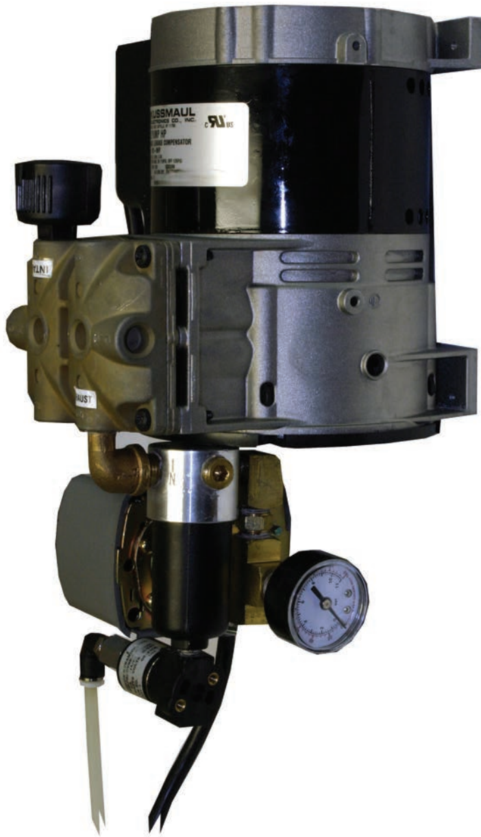
091-9-090 AUTO DRAIN ACHP INSTALLED ON 091-9HP AUTO PUMP

170 Cherry Avenue West Sayville, NY 11796 www.kussmaul.com