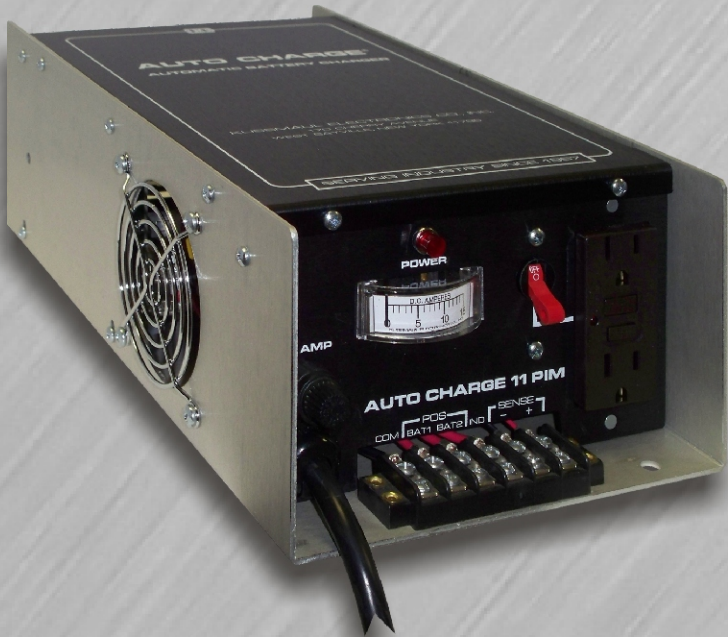
MODEL # 091-11PIM

The Auto Charge 11 PIM is a fully automatic battery charger with a separate Ground Fault Interrupter and 15 amp circuit breaker for vehicles with a dual battery system. A dual charge divider permits charging both batteries while maintaining electrical isolation. Remote voltage sensing is provided to compensate the charger output for the voltage drop in the charging wires. It is ruggedly constructed for mounting on the vehicle. This charger is ideal for vehicles with similar sized batteries and equal or no parasitic loads.